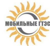
Mobile GTES JSC